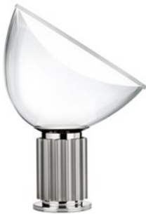
F6604004 Anodized Silver

Inspiration behind the design: Using a minimalist approach, Achille and Pier Giacomo Castiglioni used perspective to change the way we see everyday objects.