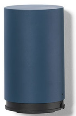
STRING LIGHT EU FLOOR SWT BLU F6484014