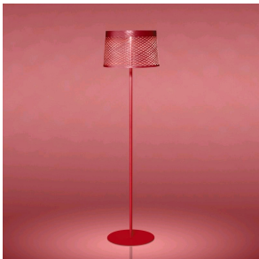
Twiggy Grid Lettura