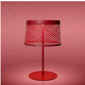
Twiggy Grid XL