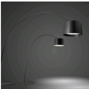
Twice as Twiggy