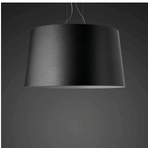
Twice as Twiggy