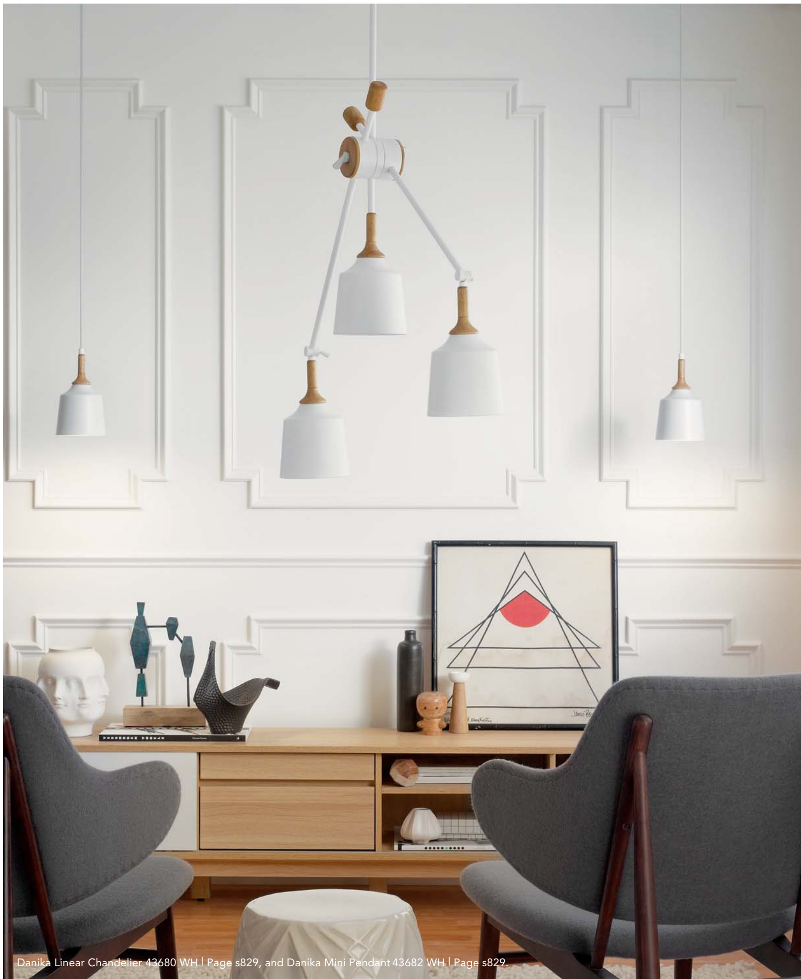
Danika Linear Chandelier 43680 WH | Page s829, and Danika Mini Pendant 43682 WH | Page s829.