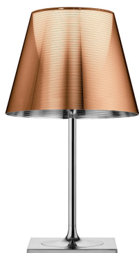
Table luminaire providing diffused lighting. Base, rod support and diffuser support in diecast, polished and chrome-plated Zamak alloy. Base cover in black injection-molded PA (Nylon). Injection-molded PC (polycarbonate) opal inner diffuser. Outer diffusers in transparent or fumée PMMA (polymethylmethacrylate), and silver or bronze on the inner surface, by vacuum aluminum coating. Injection-molded PC (polycarbonate) upper ring, completely transparent or transparent diffuser and silver diffuser) or transparent brown for the outer bronze diffuser.