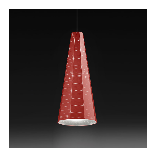
IP20 Dimmerable: + 10-